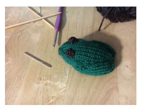
Little Knit Frog - Page 6 of 6

Sew frog eyes (or buttons) to frog's face, on top of its head. Weave in loose ends.